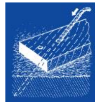
Optional ground stakes