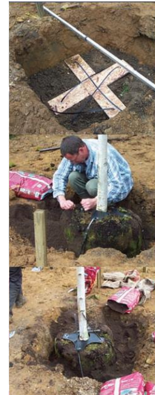
A planting involving 200 litre trees at Westonbirt Arboretum using the Arbortech Root Anchor.