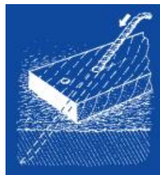
Optional ground stakes